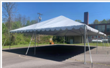
ABOVE | THE LARGE CAPACITY TENT MADE POSSIBLE WITH IMPACT GRANT FUNDING.