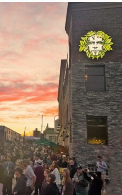
ABOVE | GREEN MAN CELEBRATES A MILESTONE WHILE SUPPORTING WNC BRIDGE FOUNDATION'S COMMUNITY INITIATIVES.