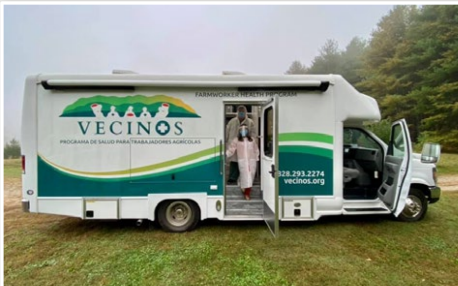
A MOBILE MEDICAL CLINIC SIMILAR TO THE ONE USED BY NON-PROFIT VECINOS WILL BE PURCHASED THANKS TO FUNDING FROM WNC HEALTH PARTNERSHIP.