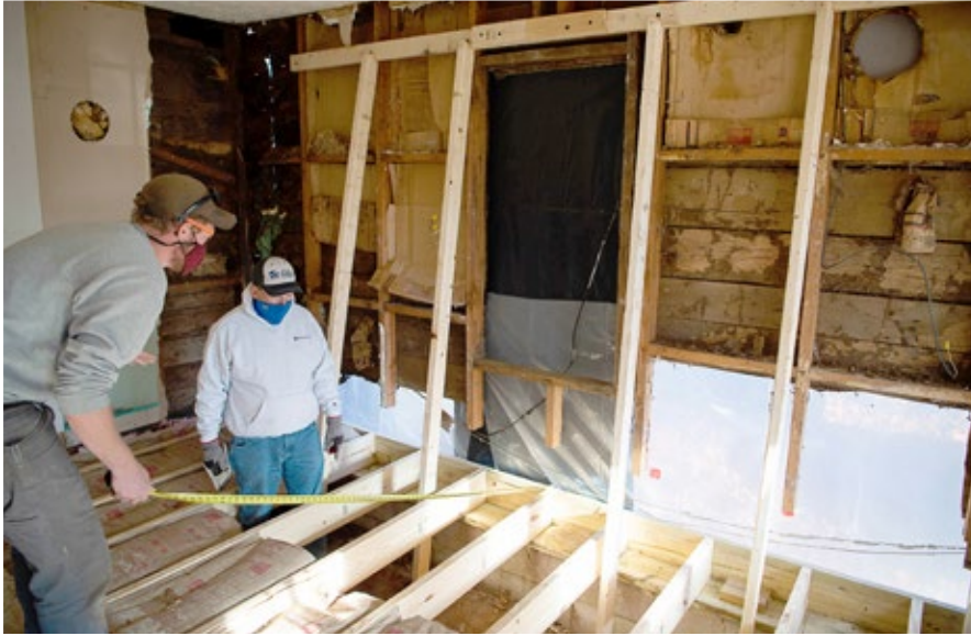
THE AAHH HOME REPAIR TEAM REBUILDS SECTIONS OF WALLS AND FLOORING TO REPAIR DEVASTATING WATER DAMAGE.

IMPACT GRANT FUNDING ALLOWED ASHEVILLE AREA HABITAT FOR HUMANITY TO COMPLETE HEALTH AND SAFETY HOME REPAIRS ON THE HOMES OF 44 LOW-INCOME OLDER ADULT HOUSEHOLDS.