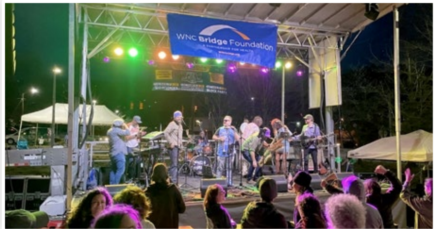
THE TWO-DAY EVENT RAISED OVER $10,000 FOR THE YOU'RE SPECIAL FUND.

"WNC Bridge Foundation, its staff, and volunteers are incredibly grateful for everyone who attended the Music Festival benefiting our You're Special Fund and would like to thank Green