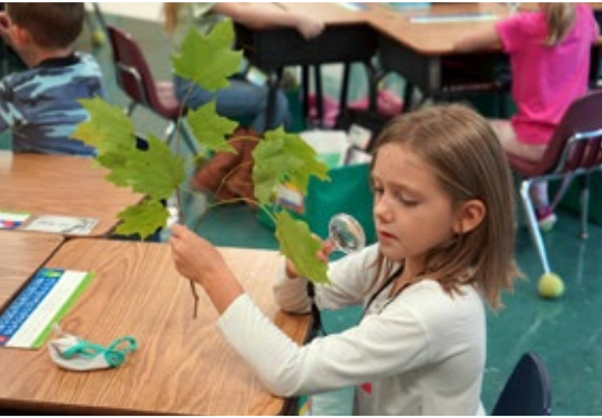
A FIRST-GRADE STUDENT AT CROSSNORE ELEMENTARY LEARNS TO MAKE SCIENTIFIC OBSERVATIONS AS PART OF THE GRANDFATHER MOUNTAIN STEWARDSHIP FOUNDATION'S WILD WATCH PROGRAM.

For academic year 2020–2021, educators from the Grandfather Mountain Stewardship Foundation collaborated with Avery County Schools to provide significant educational enrichment opportunities for students through its Wild Watch program, thanks to funding from a WNC Bridge Foundation NOW Grant.