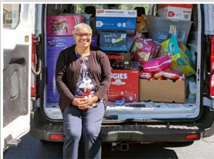
FAR LEFT | CHILDREN'S SERVICES FUND HELPS BRING A FAMILY TOGETHER.