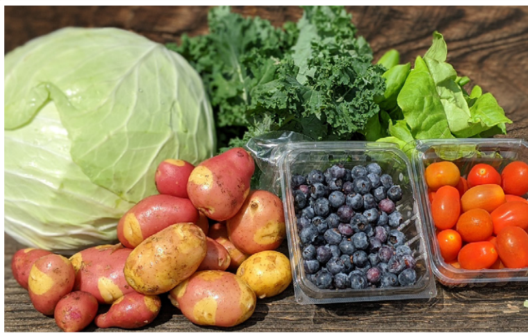
PRODUCE FROM LOCAL FARMERS IS DISTRIBUTED TO FAMILIES AND FOOD PANTRIES IN WNC COUNTIES.

to thank WNC Bridge Foundation for their support, recognizing the importance of general operating funds that this grant provided. Food hubs like ours might feel burdened by the administration and implementation of grants, often restricting our valuable infrastructure to the community as a whole. TRACTOR Food & Farms serves a diverse set of community members and systems, and WNC Bridge Foundation made significant efforts to provide the flexibility needed to serve those folks."